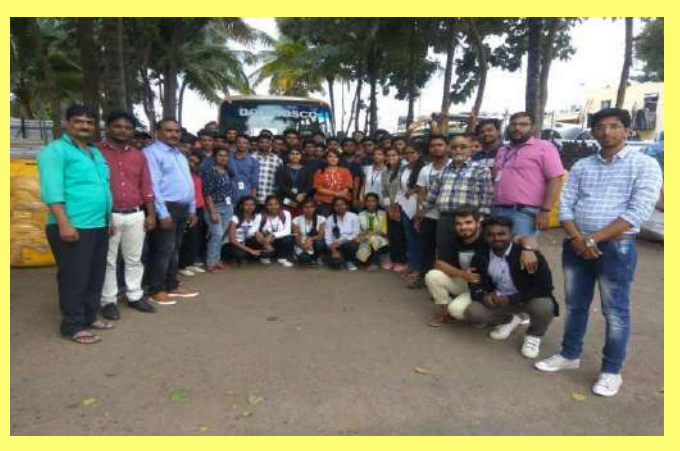
We are here to learn. To learn what we are, Why we are here What we have to do The Mother

3. Field visit to Mahesh Hardwares & Pipes on 3.11.2018, Nelamangala, Bengaluru