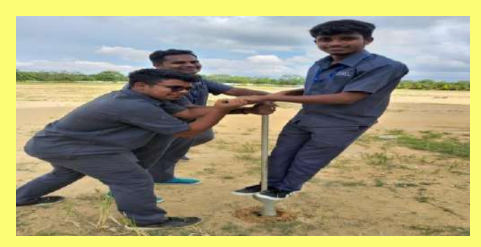
Students visit to MBA block